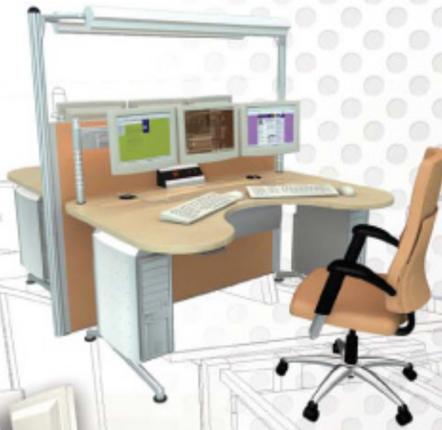
Electrically height adjustable desk with 'specialised' shaped top.