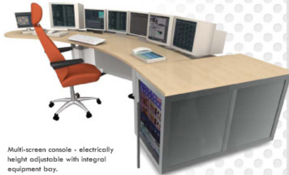
Multi-screen console - electrically height adjustable with integral equipment bay.